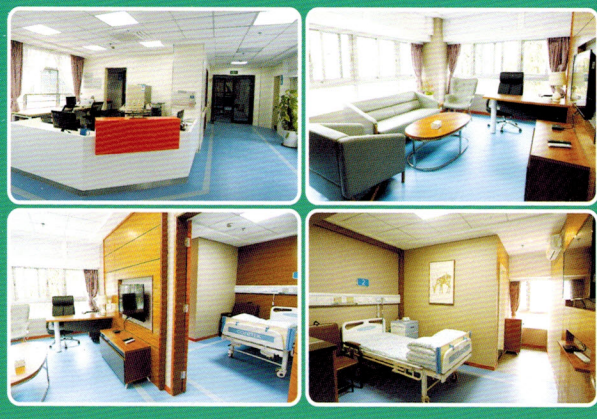
住院部 Inpatient Department

Our medical team consists of experienced experts with overseas educational background from different medical specialties.